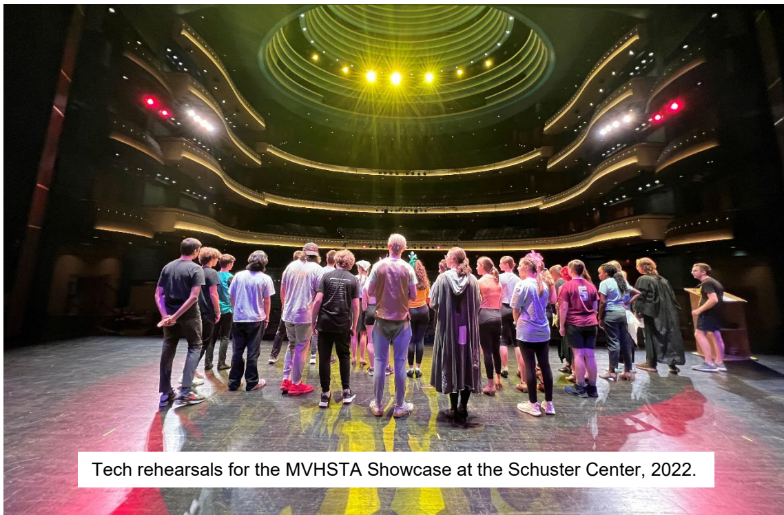
Tech rehearsals for the MVHSTA Showcase at the Schuster Center, 2022.