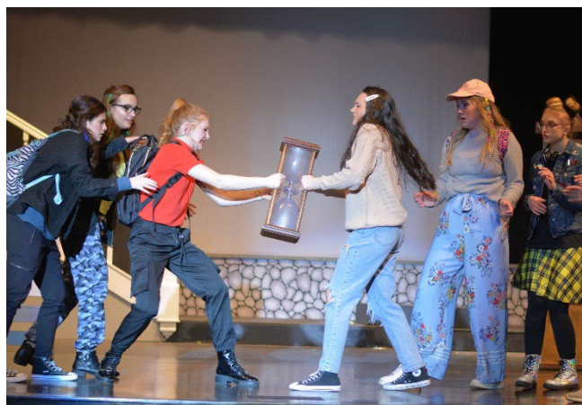
Cedarville High School