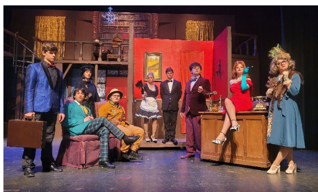
Wilmington High School