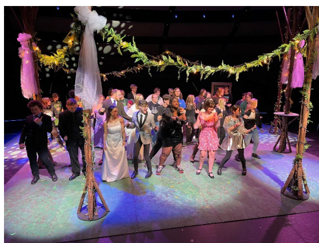
Kettering Fairmont High School