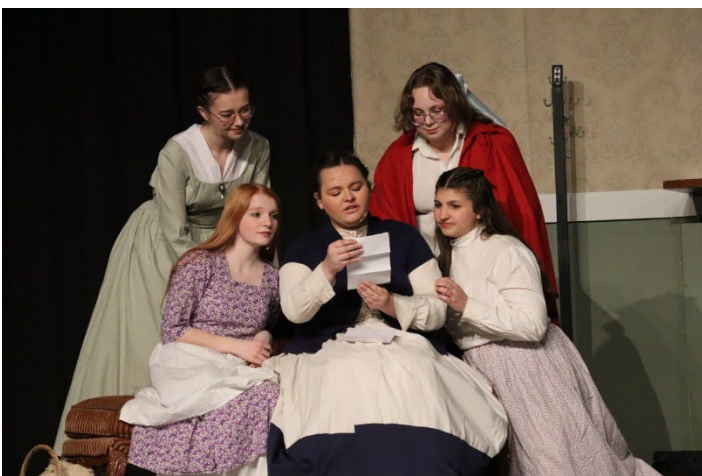
Butler High School