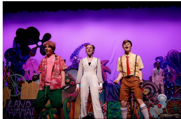
Franklin High School