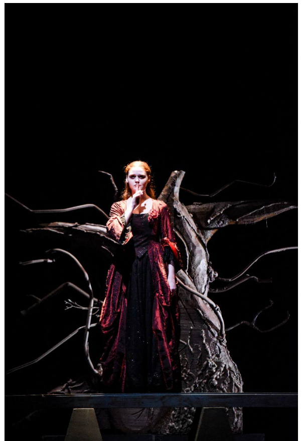
Northmont High School