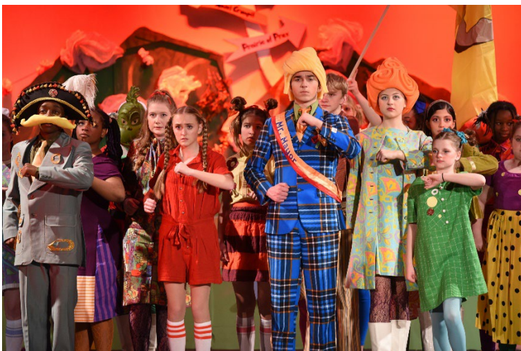
Chaminade Julianne High School