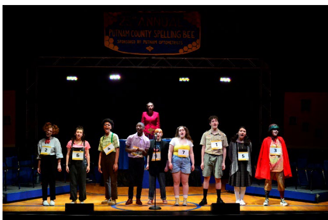
Stivers School for the Arts

The MVHSTA Team reserves the right to remove any Adjudicator from the program at any time for failure to abide by the rules laid out in this handbook.