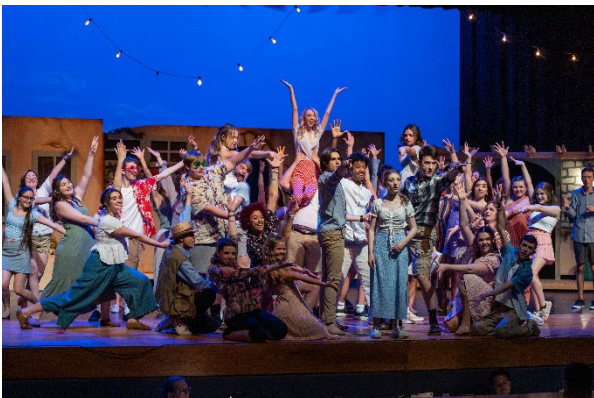
Springboro High School

For the purposes of the MVHSTAs, students are adjudicated in the category corresponding to their gender identification, not the gender of the role that they played. The MVHSTA Team will work with each Theatre Director to ensure all performers are listed on the ballots correctly. Please direct all questions to the MVHSTA Team.