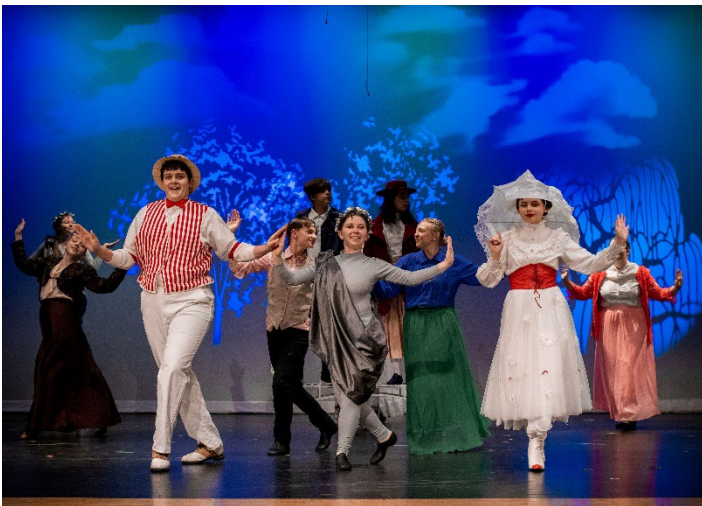
Madison High School