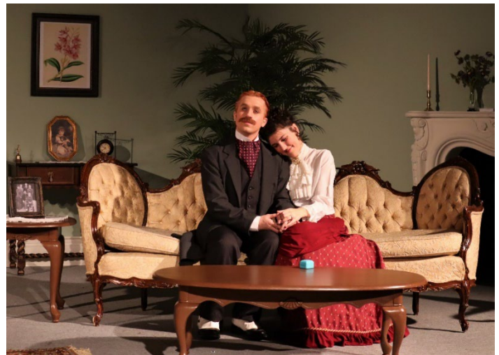
Dayton Christian High School